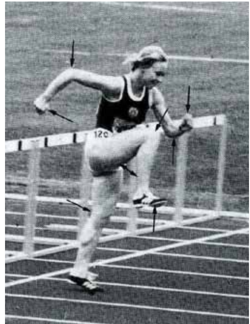
Figure 7: Annelie Ehrhardt's (GDR). Note the alignment of the lead leg, trunk and head. All these postures give a forward lean position to the hurdler at, across and away from the hurdle.

short push on the ground. The Figure 7 photo of Annelie Ehrhardt's (GDR) touchdown after the hurdle is, in my opinion, the picture of the perfection for driving forward from the hurdle. Both her arms are in a running action position, the touchdown is behind the CM, the toe of her lead leg is pointing up and the trail leg is moving into a high position.