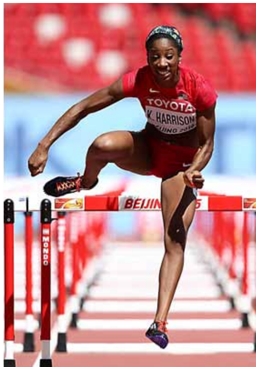
Figure 5: World record holder Kendra Harrison (USA)