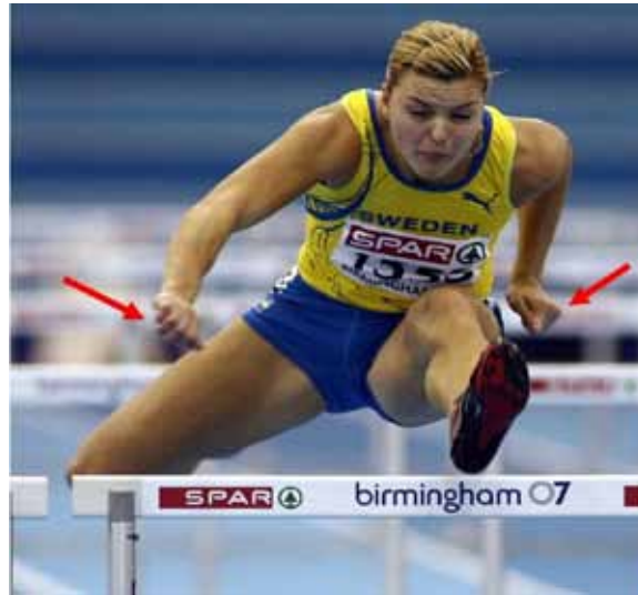
Figure 2: Susanna Kallur (SWE) shows a perfect posture of both the arms and, particularly, the hands, which are directed forward. The lead leg is well flexed.