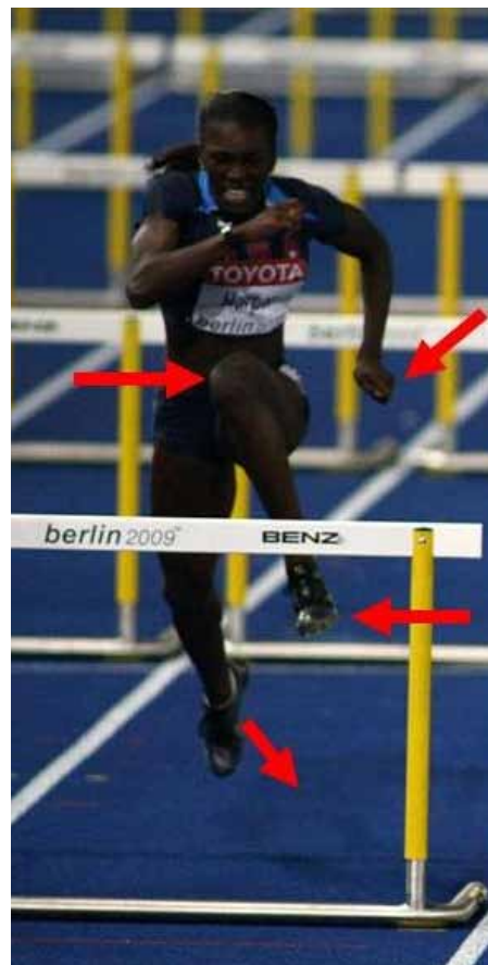
Figure 1: Dawn Harper-Nelson (USA) shows a very good forward lean. Her take off leg has broken ground contact. Good position of the arms going to the hurdle. The lead leg is well flexed and its foot is under the knee.

ment with the head and the trunk, which are less tilted than for women than for the men in the 110m hurdles. The arms must be in a forward position while the foot of the lead leg is already under the knee (Figure 1). The forearm of the lead arm often appears more or less flexed across the body, but it is necessary that it be directed forward (Figure 2). At this point, the body's centre of mass (CM) located in the hips is higher than the hurdle crossbar. When the foot of the trail leg arrives at the hurdle, the CM is already descending and the sole of the foot is facing the ground ahead of the hurdle ready to descend once the calf is over the crossbar.