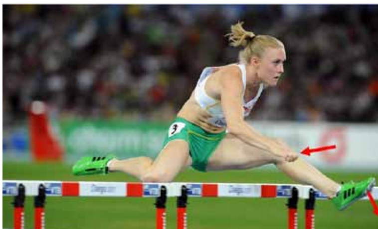
Figure 3: Here we see that the lead leg of Sally Pearson (AUS) has started its downward thrust with the foot already directed towards the ground.

very near the hurdle and behind the CM/hips, thereby shortening the flight time and giving more distance between hurdles to run quickly. According to ROSS 3 it is very important that both arms are directed forward and downward because if the arms are too high over the CM they interrupt the flow of its forward momentum (Figure 5 and Figure 6) A bent knee lead leg and a flexed ankle will enable the hurdler to snap down forcefully off the hurdle.