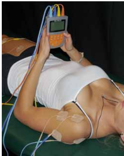
Figure 6: Shoulder

In addition, athletes can also use low-intensity pulsing protocols on the targeted muscle to improve circulation prior to the stretching session. This can be performed pre- or post-