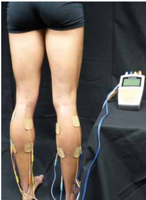
Figure 3: Calves

Another case would be for those athletes who have rigorous travelling schedules and