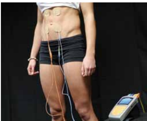
Figure 1: Abdominals

It is common practice for athletes to use low intensity exercise as an active recovery method in between more intense training sessions. The concept of active recovery is to increase the body's natural circulatory mechanisms through movement at an intensity level that is high enough to moderately elevate the heart rate without creating excessive fatigue, which would be counterproductive.