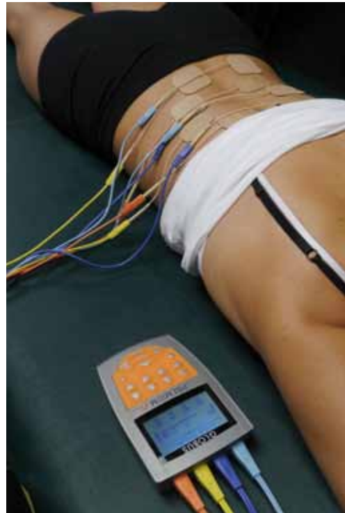
Figure 5: Back

Conventional stretching methods such as Proprioceptive Neuromuscular Facilitation (PNF) have been used for increasing the range of motion (ROM) and elongating muscle before and after a training session. One PNF method is that of reciprocal inhibition. With this method, when the athlete contracts a muscle on one side of a joint, this causes the relaxation and elongation of a muscle on the other side 26 . This method has been typically implemented with partner facilitated stretching protocols, where manual resistance is applied to a limb to promote active contraction of one muscle group in an effort to relax and elongate an opposing muscle group. Use of EMS in combination with PNF stretching