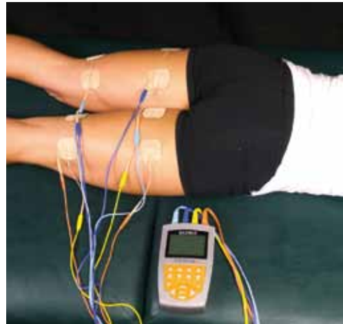
Figure 2: Hamstrings

As such, athletes have also incorporated aerobic exercise into their post-training and competition regimes to facilitate circulatory processes that remove waste products (i.e., lactic acid) and, more importantly, to improve the delivery of oxygen and nutrients to muscles and other soft-tissues.